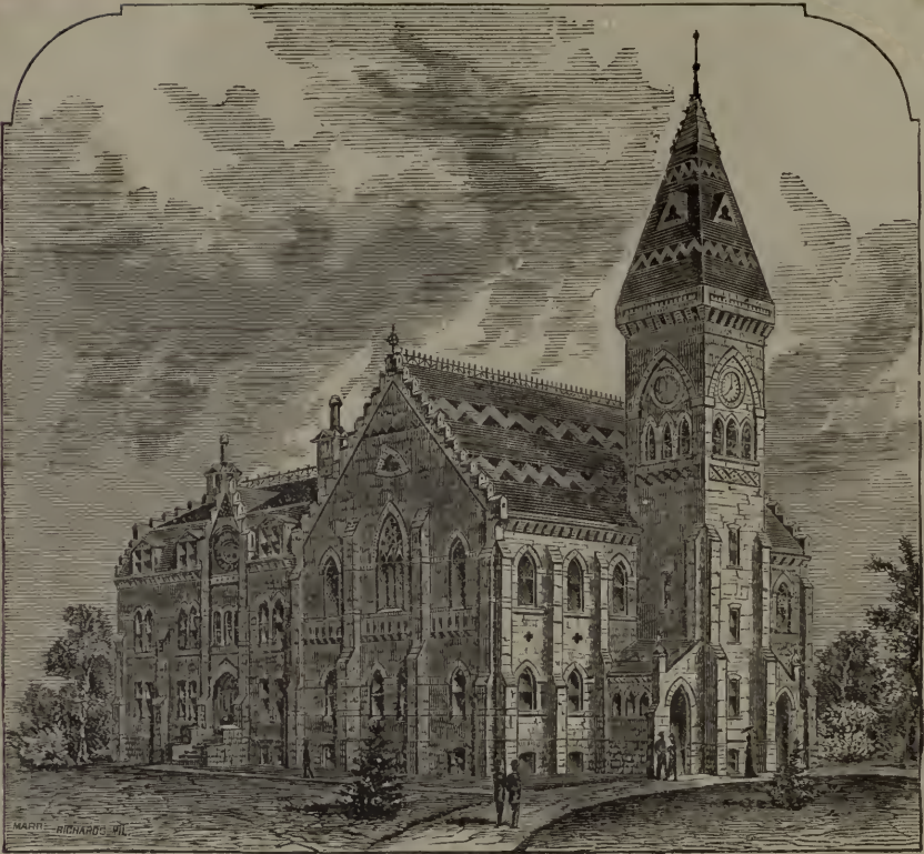
The above is a very accurate cut of the new College Building now in process of erection at Toledo, Iowa. The building is 80x150 feet, and when finished will be one of the best college buildings in Iowa.